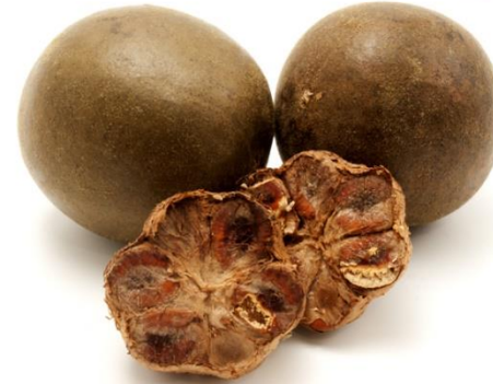
MONK FRUIT Siraitia grosvenorii

Botanical Name of Monk fruit : Siraitia grosvenorii